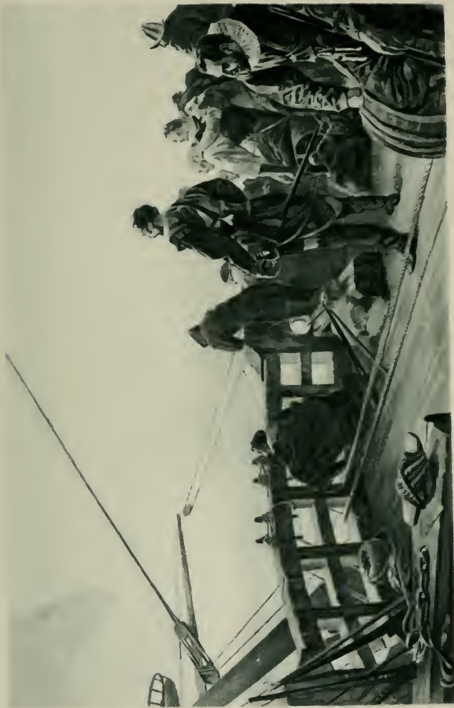
Goupil & Co. Paris